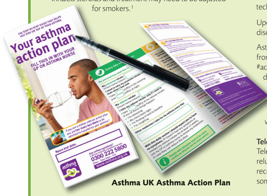
Asthma UK Asthma Action Plan

Telephone consultations may be useful in those patients who are reluctant to attend the practice or non-attenders and indeed are recommended in the current BTS/SIGN national guidance for some situations. 1