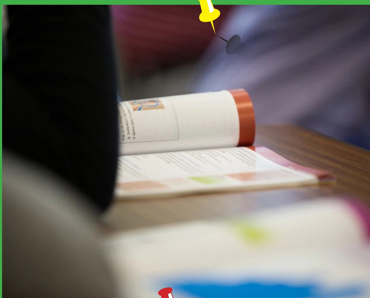
Preventable. A short film about asthma

Healthcare professionals caring for people with asthma should be appropriately trained .