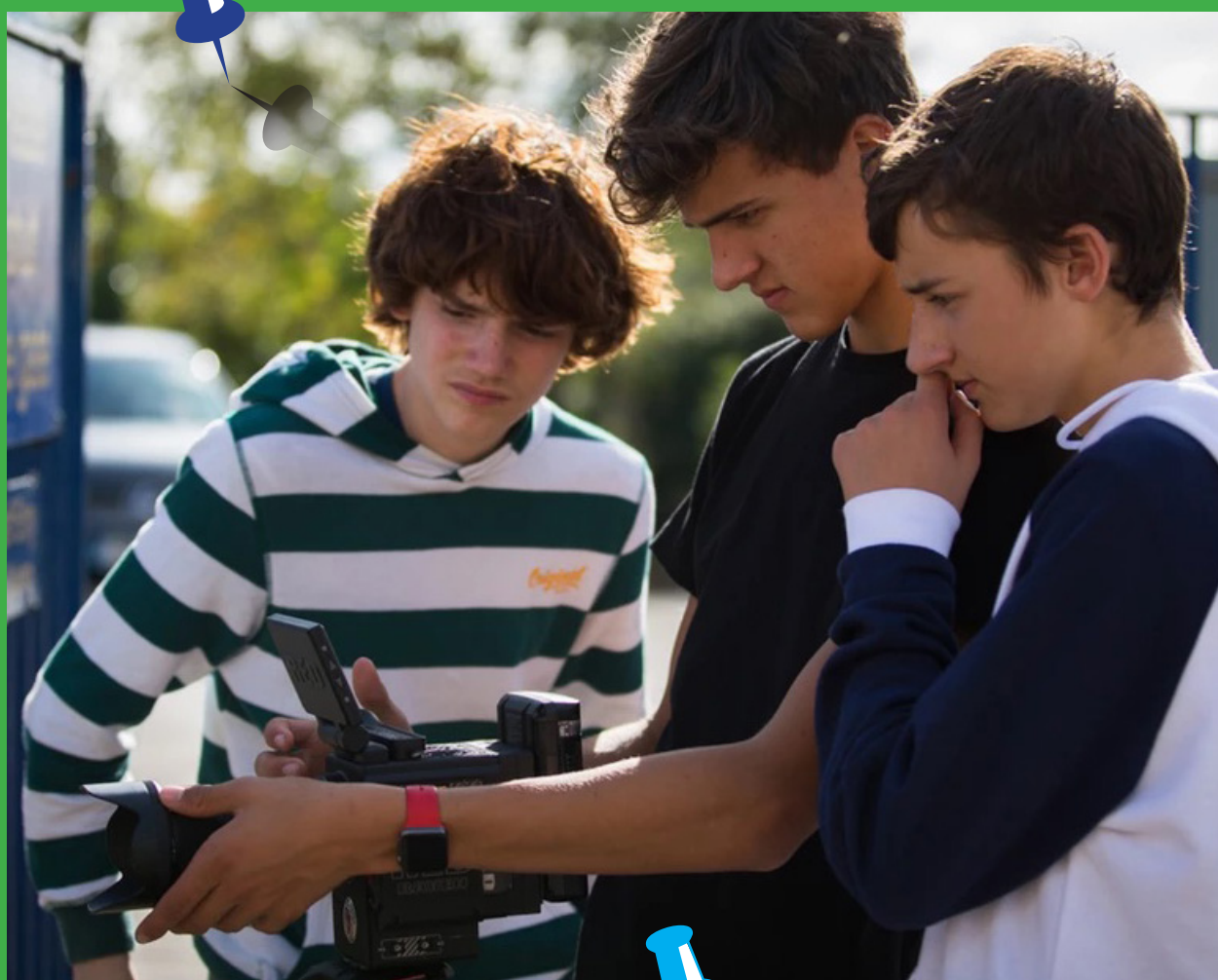
Preventable. A short film about asthma

This is a YouTube film which can be used to teach individuals in school, groups or one to one. It can be sent out with electronic reminders for annual checks, and as a follow up after the consultation. The second film can be stopped and started for teaching and Q&A sessions.