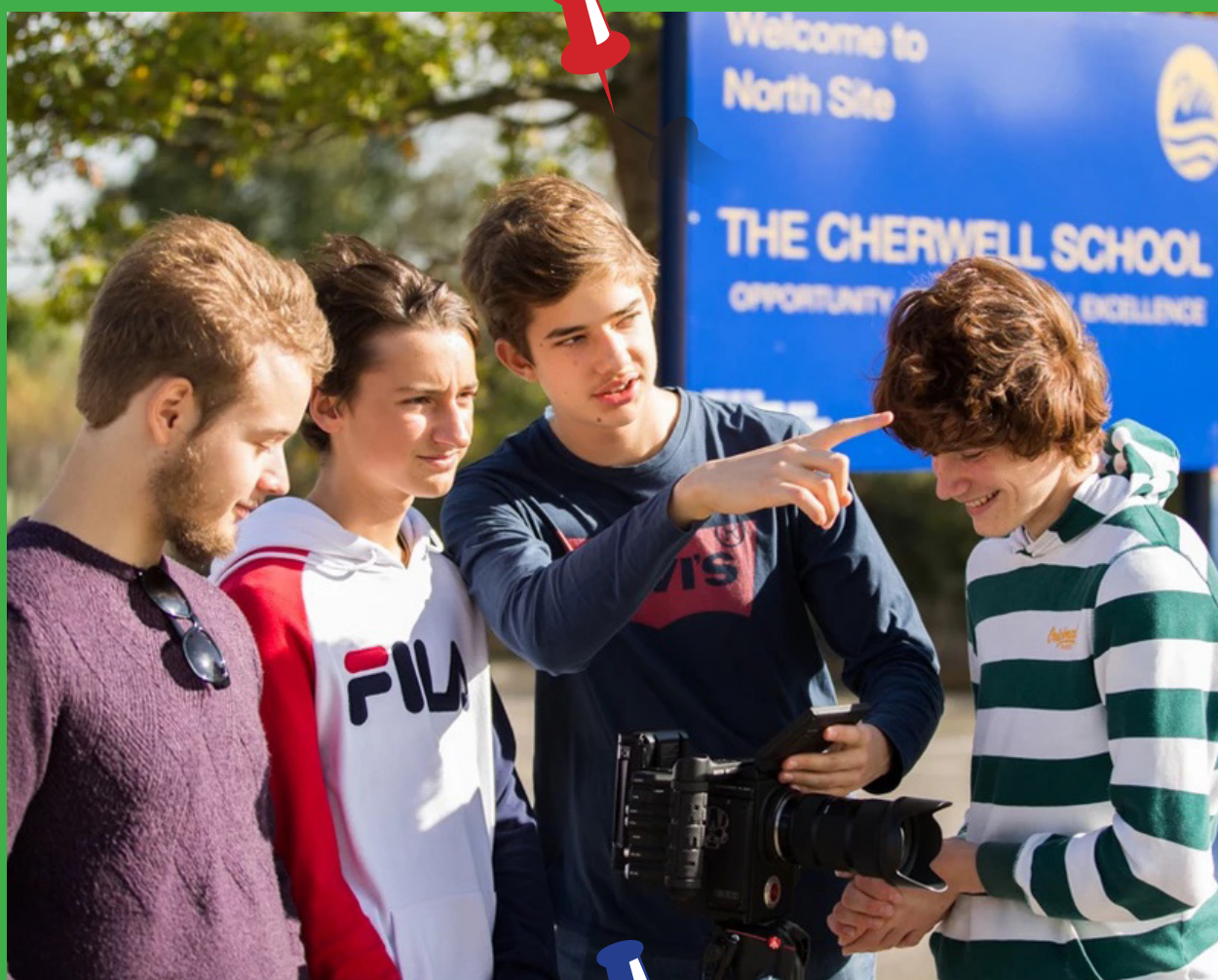
Preventable. A short film about asthma

Inhaled corticosteroids (usually brown inhalers ) prevent asthma attacks and should be prescribed for everyone with asthma.