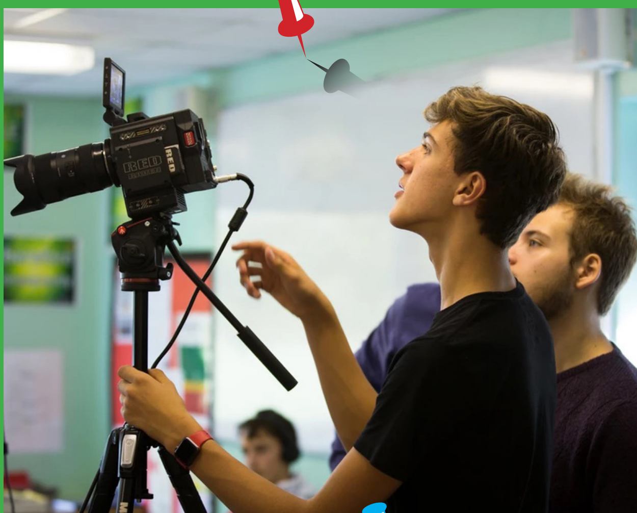
Preventable. A short film about asthma

Reliever inhalers (usually blue ) are only meant for emergency use. If you have one, let your friends and teachers know, and tell them where you keep it.